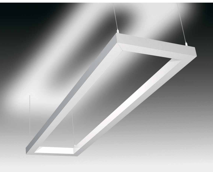
WEGA-FRAME-B / WEGA-FRAME-C